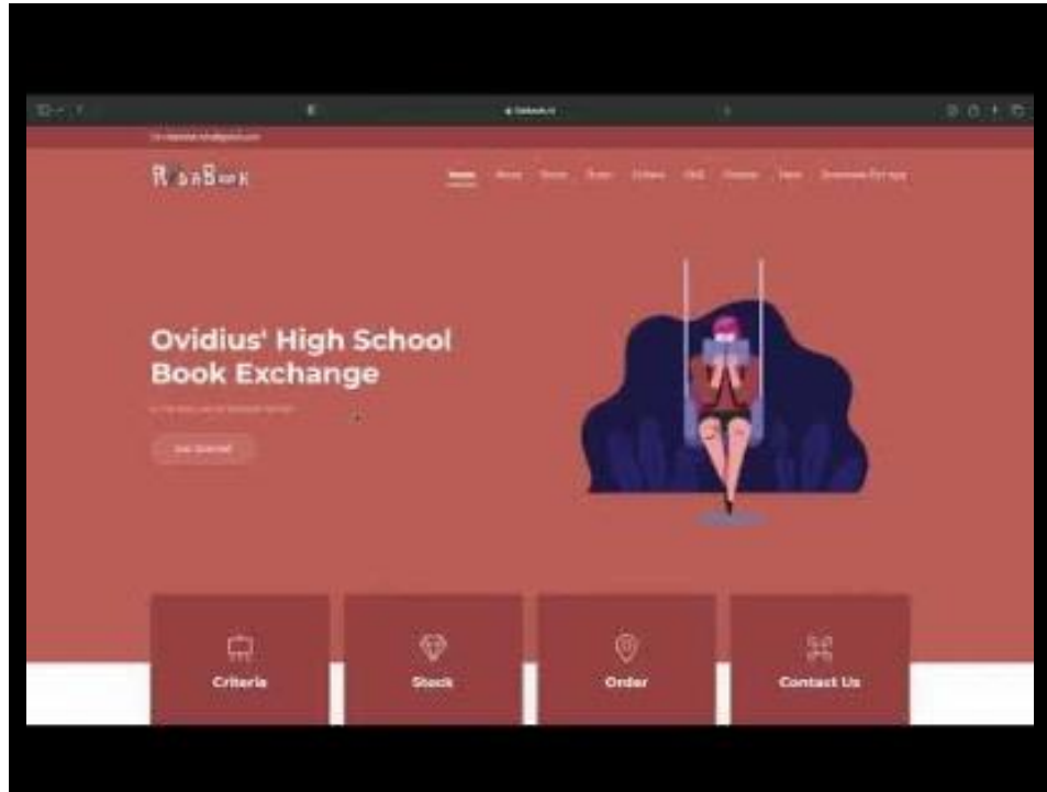
Demo video of our site