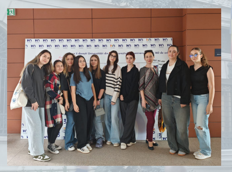
Școala Centrală National College Bucharest